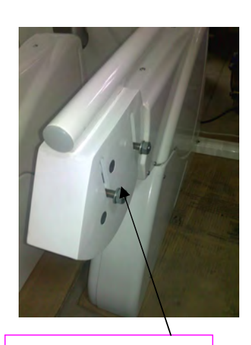
1. Loosen the screws and nuts.